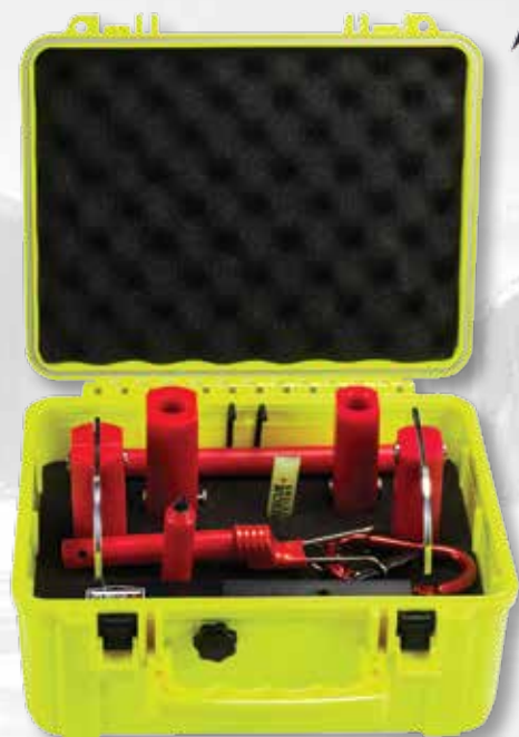
Attachment Complete Kit