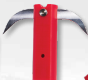
Grapnel Hook with Line Tensioner