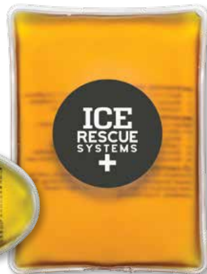
Heat Pack Size: 5" x 7"

Ice Rescue Systems hand warming tube offers great protection for EMS or standby personnel waiting to receive the patient.