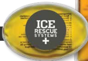
Hand Warmer Size: 3"x 4"