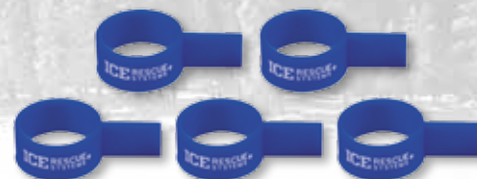
Dog Rescue Bands