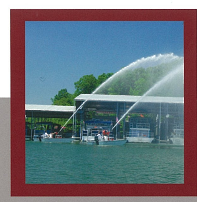
Portable Fire Pump Portable yet powerful, the removable fire pump converts your R ONE Series boat into a waterfront firefighting resource.