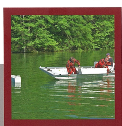
Floating Sea Boxes

Custom fit nonskid panel system enable K9 units unobstructed access to the water. Keeps them safe and focused on the task at hand.