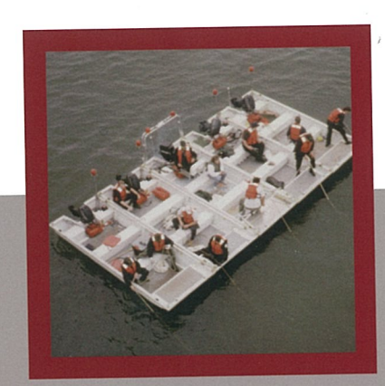
Connect Multiple R ONE Series

Always bring all the water gear you might need to every mission. Saves room at the station, too.