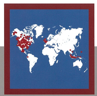
Worldwide Across the country and around the world, first responders rely on the R ONE Series boat to be the one boat for every mission.