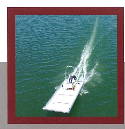
Speed When You Need It R ONE Series boats have a top speed of 38 mph, getting you to - and from - the scene quickly.