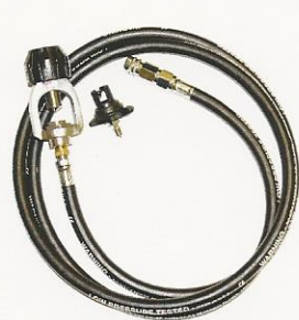
(OPTIONAL) QUICK FILL KIT LEAFIELD VALVES #QFC7